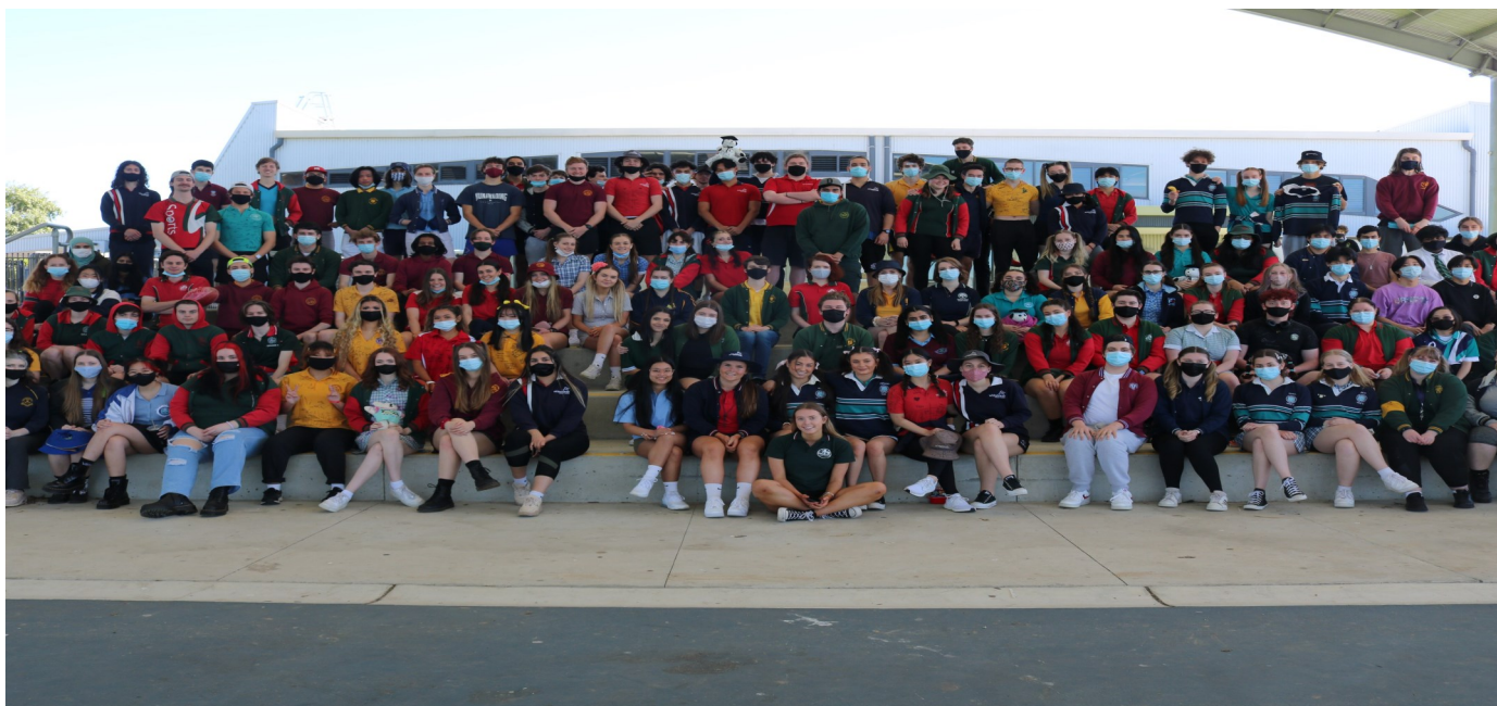
Year 12 students Primary School Day