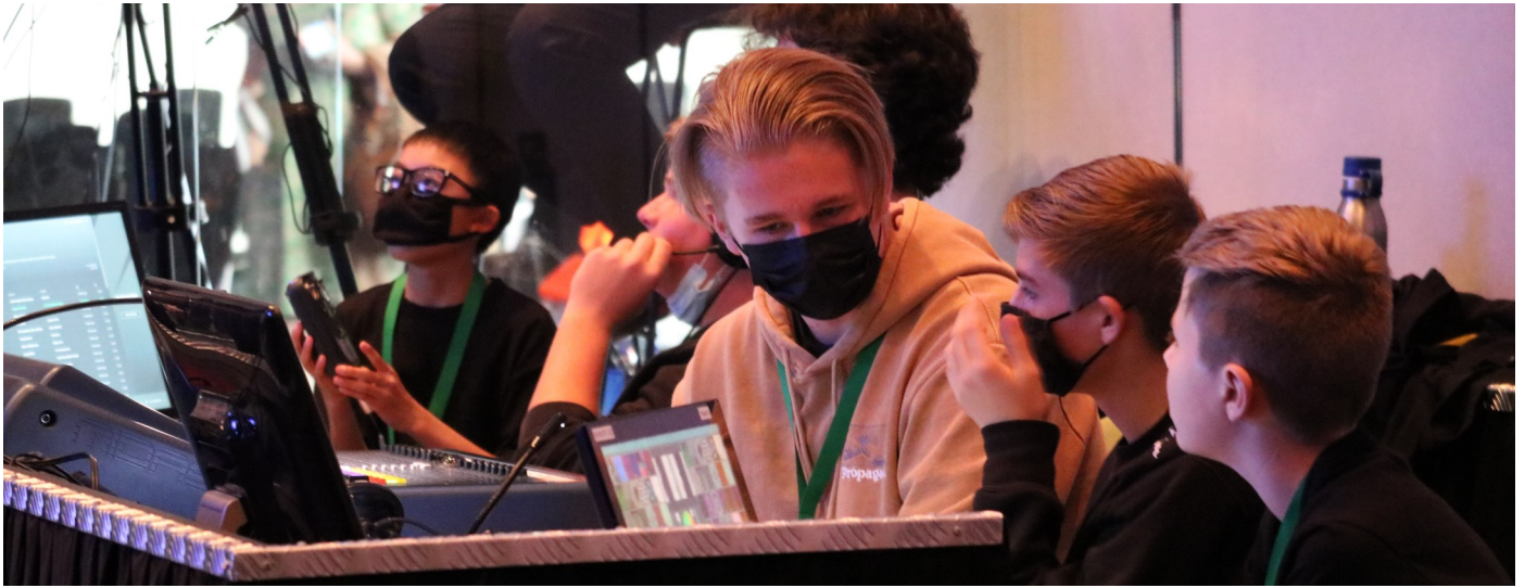
Tech Crew at work—House Performing Arts, 25th February 2021